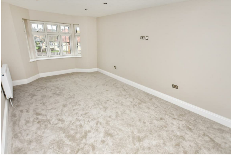
Bedroom One 17'9 x 10'6 (5.41m x 3.20m)

Upvc double glazed bay window to front aspect, carpet, smooth plastered ceiling with inset spotlights, radiator, TV and power points.