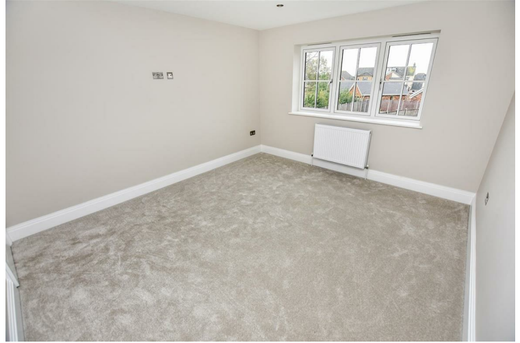
Bedroom Two 13'1 x 11'8 (3.99m x 3.56m)

Upvc double glazed window to rear aspect, carpet, smooth plastered ceiling with inset spotlights, radiator, TV and power points.