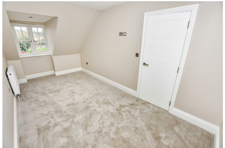
Bedroom Three 17'2 x 8'3 (5.23m x 2.51m)

Upvc double glazed window to front aspect, carpet, smooth plastered ceiling with inset spotlights, radiator, TV and power points.