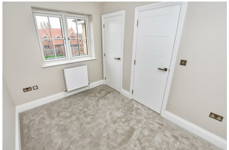
Bedroom Four 10'1 x 8'3 (3.07m x 2.51m)

Upvc double glazed window to rear aspect, carpet, smooth plastered ceiling with inset spotlights, radiator, storage cupboard, TV and power points.